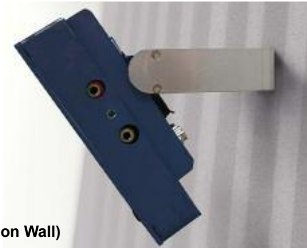
(TLM-70D Mounting on Wall)