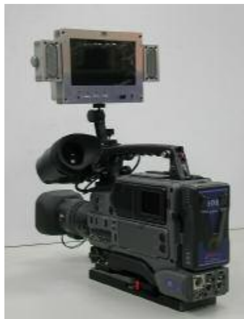
(TLM-70D on DV Cam)