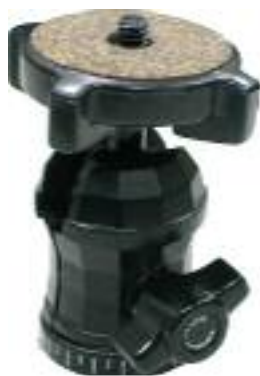
Additional accessories --- BH-05 The application to install TLM-70D on a DV Cam by using BH-05